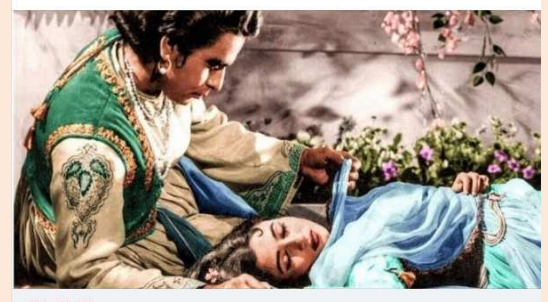
FRI, JUL 16

The month also saw, after a long gap, re-starting of the film club with the Hindi film 'Mughal-E-Azam' as a tribute to film star Dilip Kumar on his demise this month. With the weekly India@75 Quiz coming to a closure on Aug 15th, the Embassy of India is gearing for 75th Independence Day celebrations.