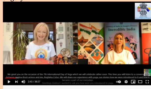
Kutfo Ep 3